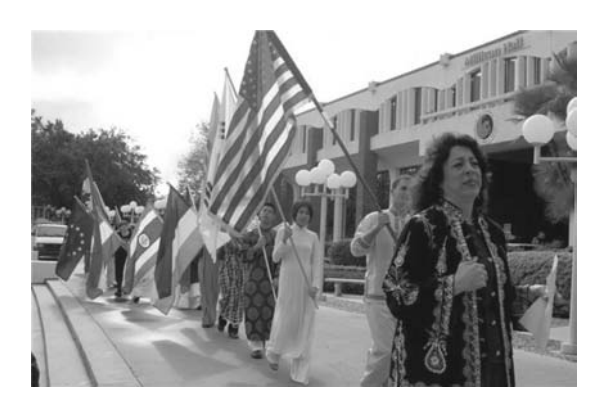
Figure 1.3 Respect for differences is an important component of mindful intercultural communication. Additionally, it is important to maintain an open mind and strive to see the world from the different perspectives of other cultures. Such an approach to communication can go a long way toward reducing misunderstandings and preventing conflict.

communication encounter. For example, if a US student is communicating with an international student from Japan, rather than begin a conversation abruptly, a common practice in the United States, he/she will begin with a formal greeting, since that would be the way the Japanese student would be used to starting a conversation.