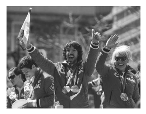
Figure 1.1 An event like the Olympic Games is the scene of many intercultural encounters. The Olympic Village is composed of athletes from all over the world who come to compete with one another. Spectators, too, come from far and wide to witness this international event and to interact with members of diverse cultures.

Mostly ignored by IR theorists, cultural differences, whether they occur among diverse groups within a nation or between two or more individuals from different nations, present both challenges and opportunities for communication. Cultural differences have the potential to lead to misunderstanding, miscommunication, dispute, and even conflict. Sometimes diverse cultural groups within a nation will come into conflict with one another; one example is the tensions that exist in cities like New York, Chicago, and Los Angeles