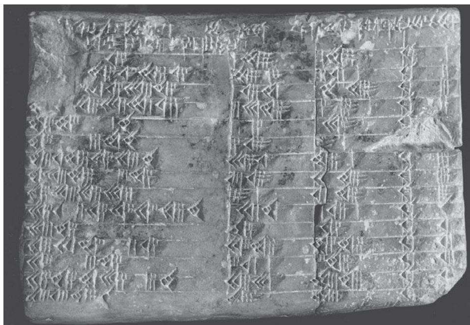
Slika 3. Pločica Plimpton 322