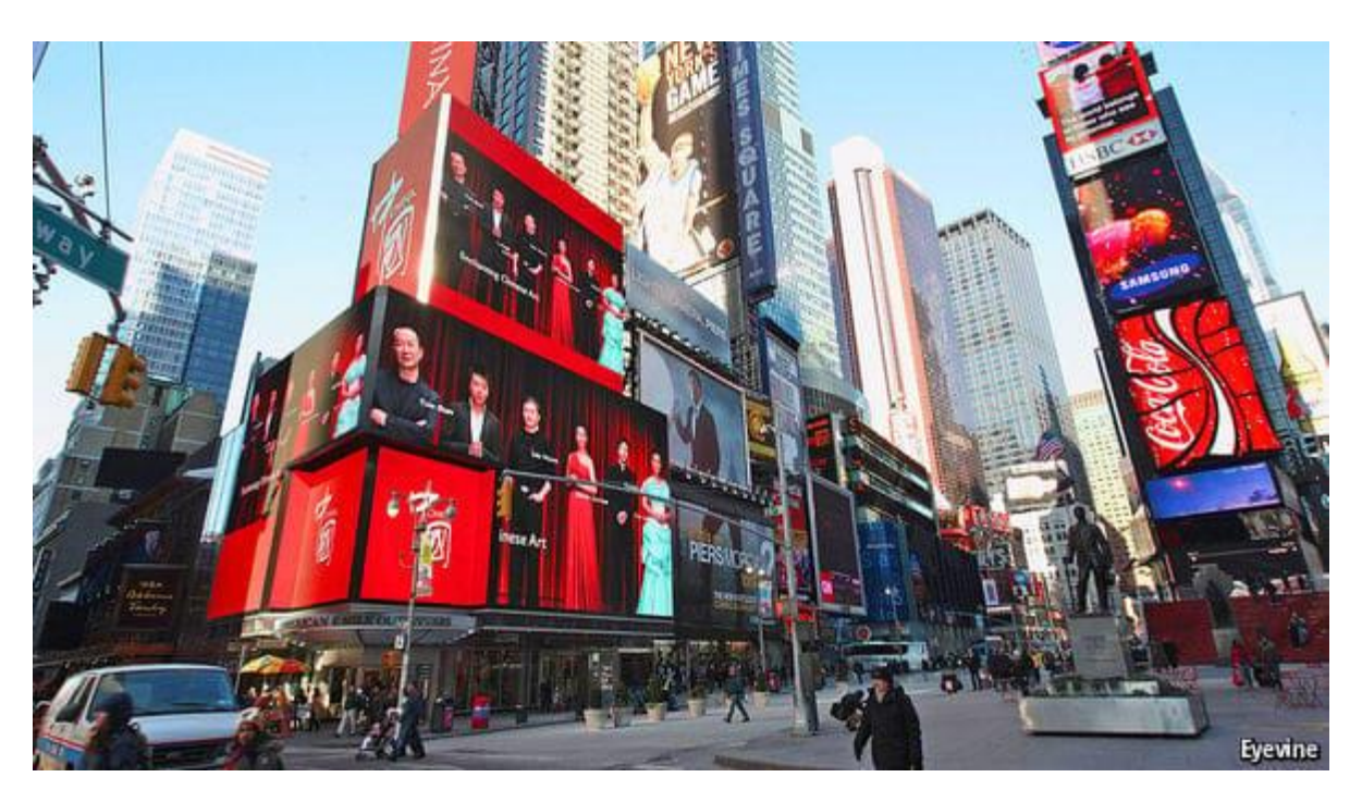
Mar 23rd 2017 | BEIJING

IMAGES of China beam out from a giant electronic billboard on Times Square in the heart of New York city: ancient temples, neon-lit skyscrapers and sun-drenched paddy fields. Xinhua, a news service run by the Chinese government, is proclaiming the "new perspective" offered by its English-language television channel. In Cambodia's capital, Phnom Penh, children play beneath hoardings advertising swanky, Chinese-built apartment complexes in the city. Buyers are promised "a new lifestyle". Across the world,