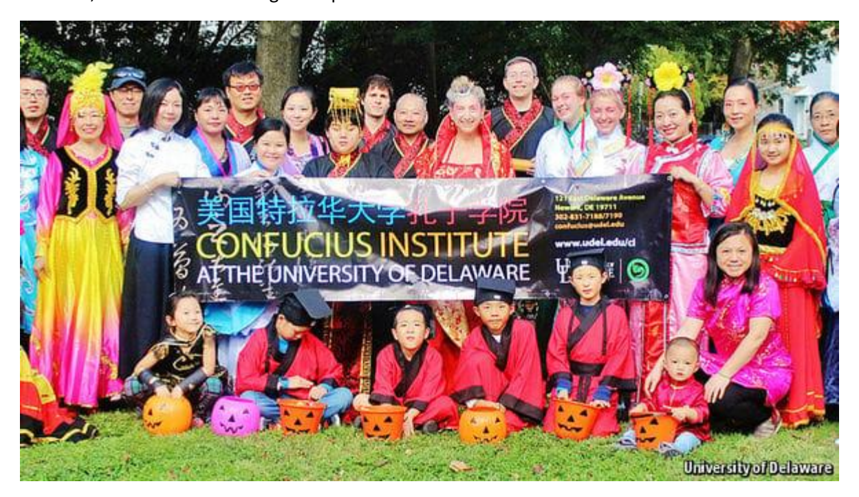
Let there be no confusion about Confucius

Instead, China's soft-power strategy focuses mainly on promoting its culture and trying to give the impression that its foreign policy is, for such a big country, unusually benign. The culture that the party has chosen for foreign consumption is mainly one that was formed long before communism. Confucius, condemned by Mao as a peddler of feudal thought, is now being proffered as a sage with a message of harmony. Since 2004 China has established some 500 government-funded "Confucius Institutes" in 140 countries. These offer language classes, host dance troupes and teach Chinese cooking. Many of them are on campuses (an activity involving one, at the University of Delaware, is pictured). China has also set up more than 1,000 "Confucius Classroom" arrangements with foreign schools, providing them with teachers, materials and funding to help children learn Mandarin.